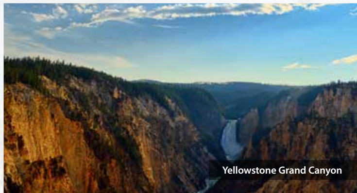
Yellowstone Grand Canyon

This morning our route will take us north as we travel just to the west of the stunning Teton mountain range and through the gorgeous Targhee National Forest. Before we enter and begin our journey in Yellowstone National Park we'll make a short stop in the small town of West Yellowstone. Then, it will be time for us to enter Yellowstone National Park and explore its countless wonders. We'll stop to see the most famous geyser of them all, Old Faithful. We'll have the opportunity to walk along the boardwalk and explore the largest collection of hydrothermal features in the world. After a memorable visit to Old Faithful, we'll journey north to witness more incredible geothermal activity at the Fountain Paint Pots. Return to West Yellowstone where we'll check into our home for two nights. You'll be perfectly situated to explore the town, relax, and enjoy dinner on your own. Meals: B